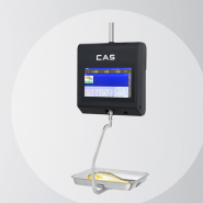
BAR CODE PRINTER